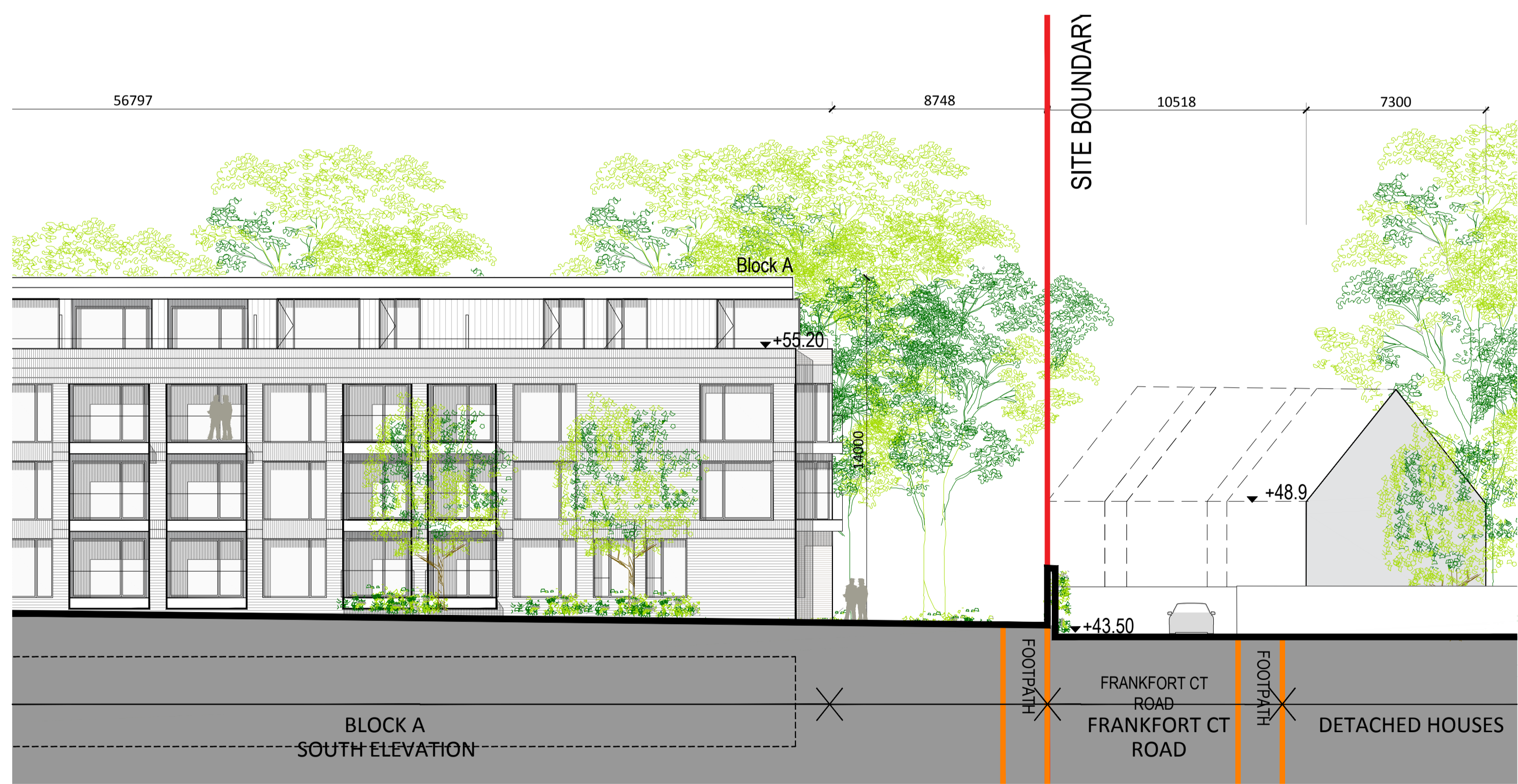
Site Elevation F-F ESC 1:200